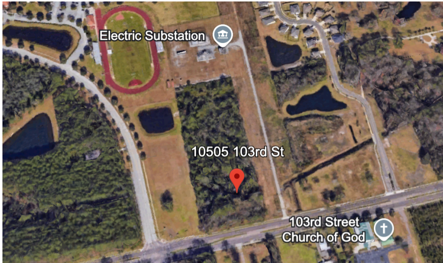
Developers purchased the 6.52-acre build site for $675,000 in 2023.

The venture will target individuals and families earning 100 percent to 120 percent of the area median income (AMI). The community will host a variety of Class A amenities, including a swimming pool with cabanas, fitness center, yoga studio, and other offerings. MAS purchased the presently vacant 6.52-acre build site for $675,000 in late 2023.